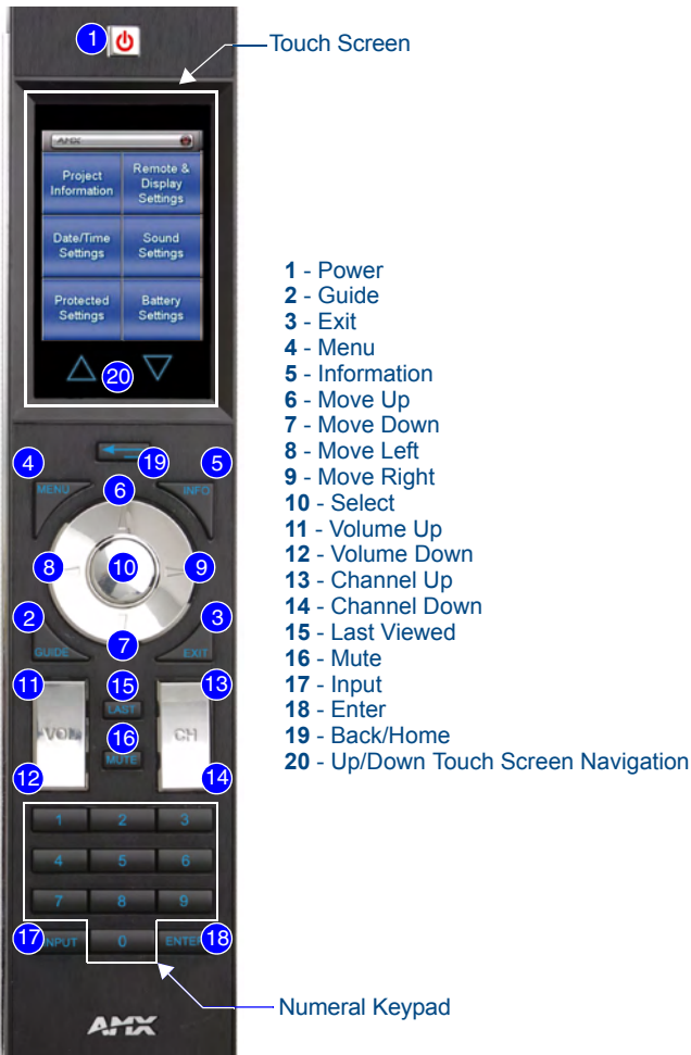
FIG. 1 Mio Modero R-4 Remote